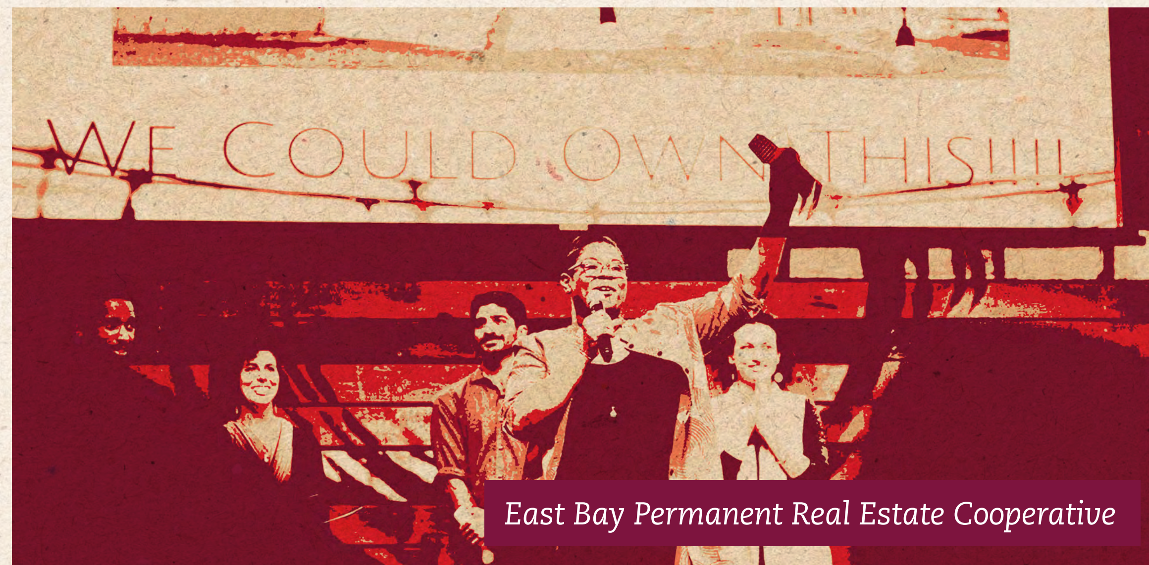
East Bay Permanent Real Estate Cooperative

Legal advocacy is part of the broader movement infrastructure and is necessary to shift policies and protect organizers. Unfortunately, few legal firms are dedicated to supporting base-building organizations and directly impacted people. ArchCity Defenders is a movement-centered law firm offering legal representation, impact litigation, community collaboration, and policy advocacy. They are committed to abolition, revolutionary justice, and self-determination by partnering closely with organizers on the ground. They note, “We have helped to defund the police and make sure it goes back into the community.”