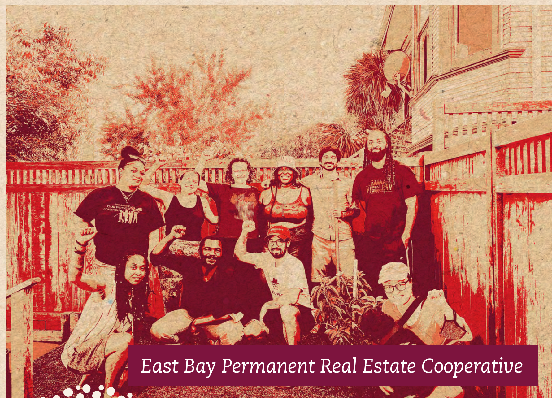
East Bay Permanent Real Estate Cooperative

East Bay Permanent Real Estate Cooperative (EB PREC) is a community-centered development cooperative. They are democratically run and led by people of color. They remove land and housing from the speculative market to create permanently affordable, community-controlled homes.